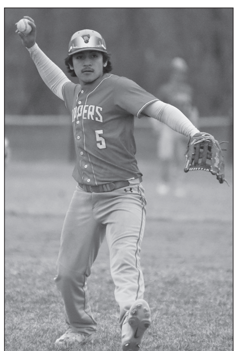
Students continue to work hard in the classroom and in athletics. Go Clippers!